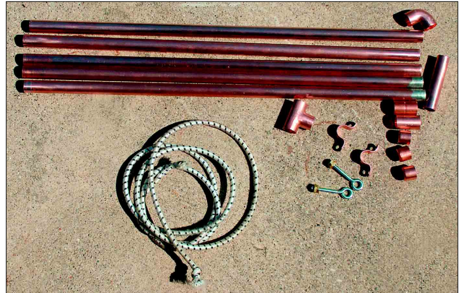
Figure 2—The antenna components—ready for construction.

around the pipe so that you can attach them to the Plexiglas. Mark the location of the holes and drill them out. Replace the pipe clamps and attach them with 6-32 bolts, star lock washers, flat washers and nuts. Cut two short pieces of wire (no. 16 or 14)—I used no. 16 stranded wire. Attach ring terminals on one end of one wire and on both ends of the other wire. Make these wires long enough so that they can go from the center terminal of the SO-239 to a clamp (I used the clamp on the <sup>3</sup>/<sub>4</sub> wavelength section). Also connect one of the mounting bolts on the SO-239 socket to the other bolt on the second clamp (the matching stub). Keep the wires as short as possible. An