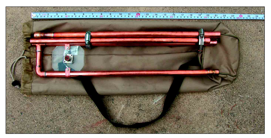
Figure 7—The completed folding J-pole, ready for packing.

446.90 MHz the SWR was 1.1:1. Once the SWR is where you want it, tighten the clamp bolts. You should be able to duplicate these results without too much trouble