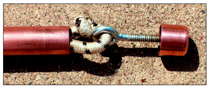
Figure 3—A completed eyebolt assembly. These serve as an anchor point for the bungee cord.