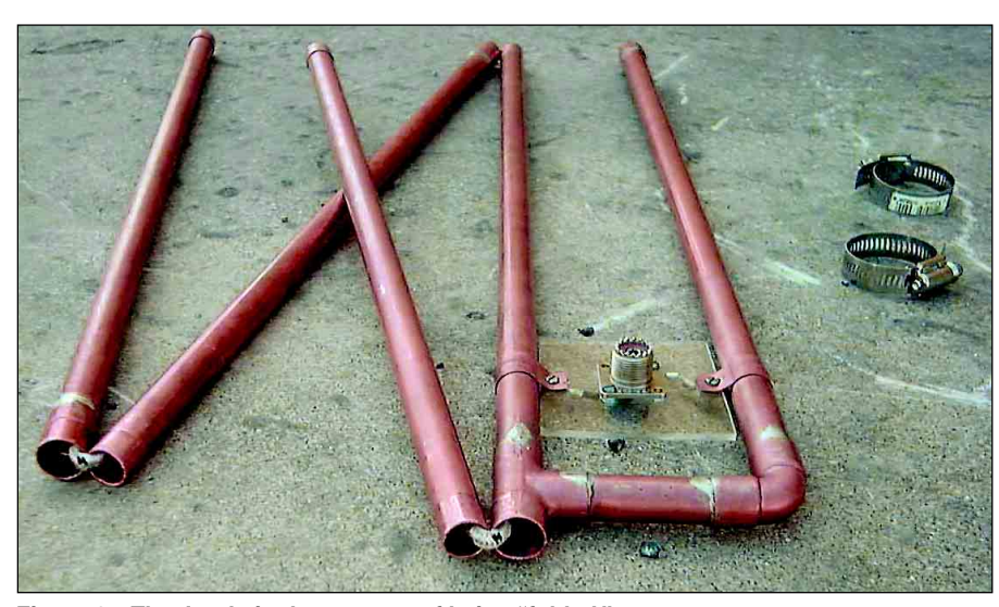
Figure 6—The J-pole in the process of being "folded."