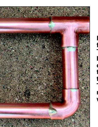
Figure 5—The antenna feed point assembly. The feed point can be slid up and down on the radiator and the matching section to adjust the SWR. The SO-239 socket rear needs to be weatherproofed.

both pipe clamps about 3 inches up from the bottom of the radiator and the matching stub and work your way down. You will want to tighten the clamps reasonably well so you get a reliable RF analyzer reading when testing. I was able to get the SWR to 1:1 at 146.6 MHz using an MFJ-269 antenna analyzer. At