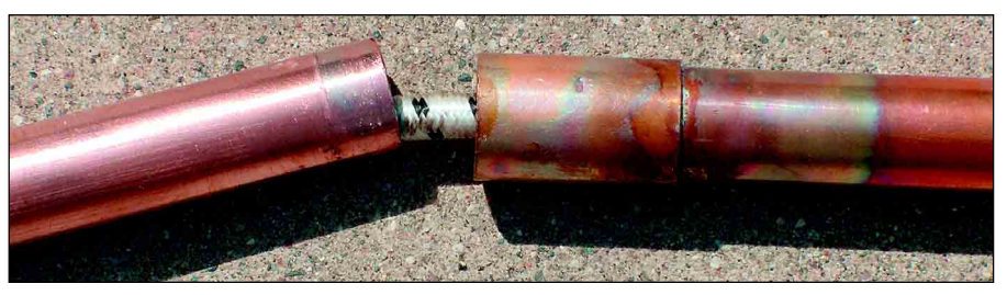
Figure 4—The bungee cord runs through each of the antenna elements.